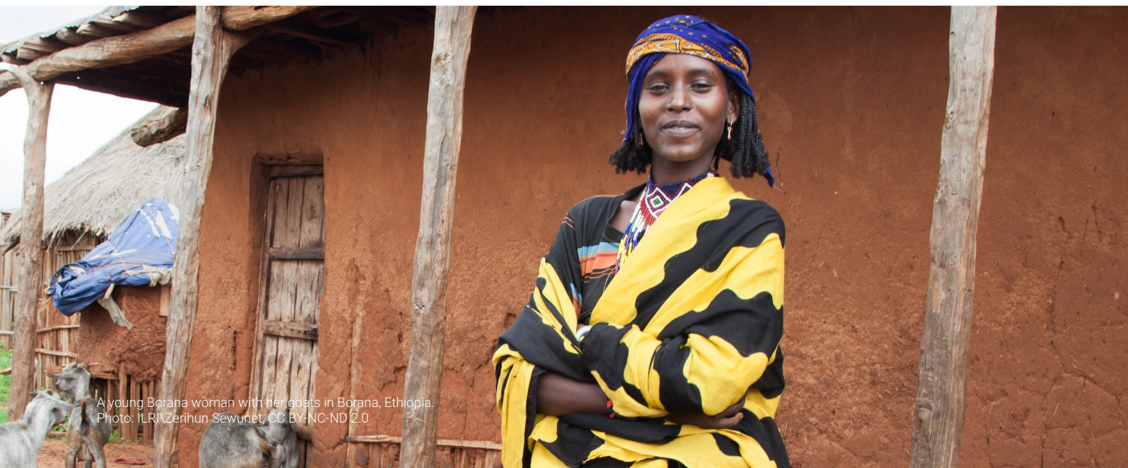
A young Borana woman with her goats in Borana, Ethiopia.