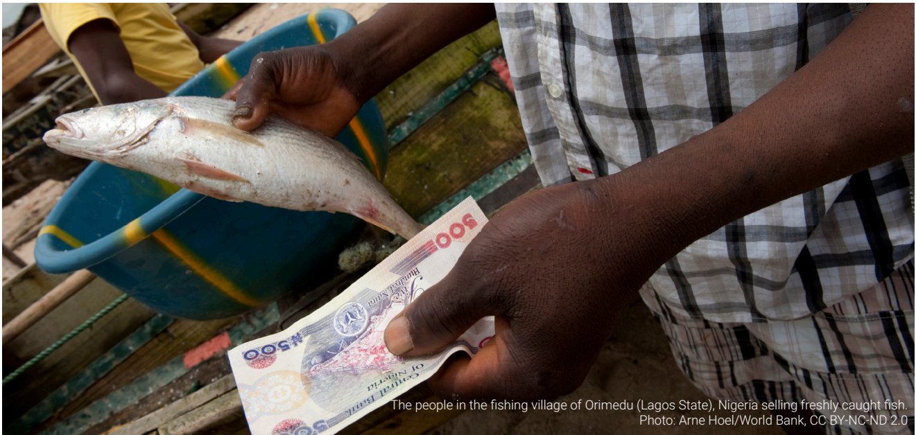
The people in the fishing village of Orimedu (Lagos State), Nigeria selling freshly caught fish.

and Ethiopia, have coherent green growth and/or green employment policies. Nigeria’s updated national climate plan, the Nationally Determined Contribution (NDC; FRoN, 2021), has a major new section on the importance of investing in ‘green job’ creation and highlights the needs and potential of young people.