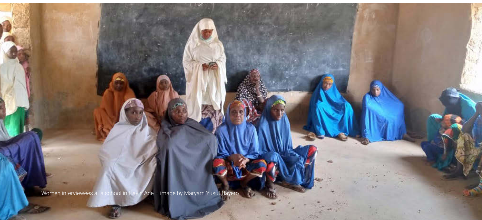
Women interviewees at a school in Hayin Ade