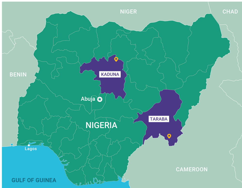
FIGURE 1: MAP OF STUDY AREAS

The map shows the approximate locations of the study areas (Hayin Ade in Kaduna State and Wuro Alhaji Idrisa Bappate in Taraba State).