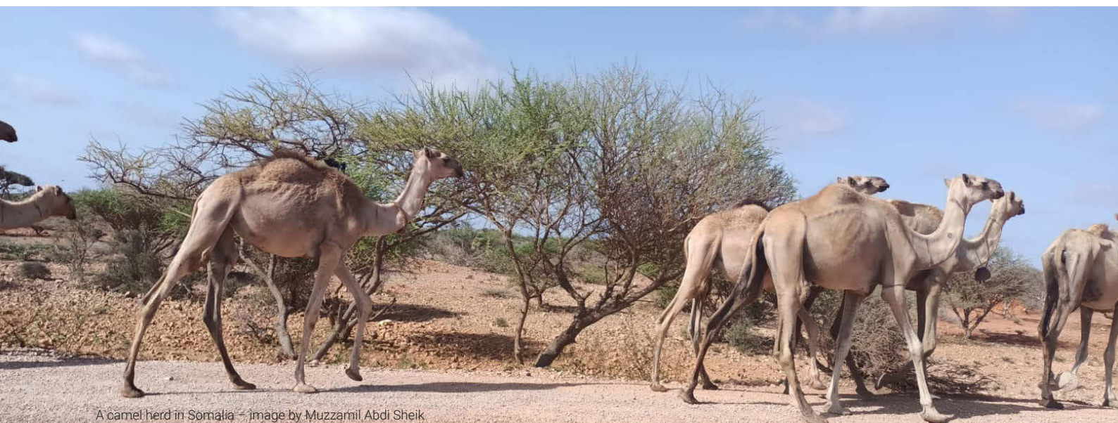
A camel herd in Somalia