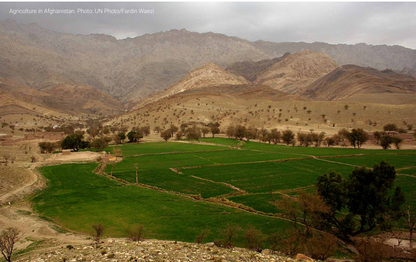
Agriculture in Afghanistan.

A key point to be made here is that, although many farming households across the provinces and particularly in Herat and Laghman are engaged in the market, it is evident from their comments that they are oriented towards meeting subsistence needs and not maximising income from market sales. A comment that was made across all three provincial locations is